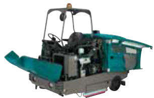
EASY OPEN SERVICE

EZ-Remove™ debris tray glides in and out on wheels, improving productivity and operator safety. The convenient and sturdy handle simplifies debris transport and disposal.