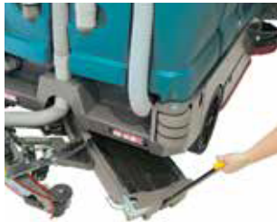
EZ - REMOVE DEBRISTRAY

Lower maintenance and repair costs with a heavy-duty rear squeegee protection kit that prevents damage to the machine.