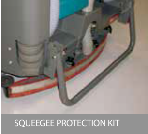
SQUEEGEE PROTECTION KIT

Achieve outstanding cleaning results in the harshest industrial environments with dual cylindrical brushes or three gimble mounted disk brushes for aggressive cleaning.