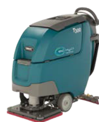
Orbital: 500 mm