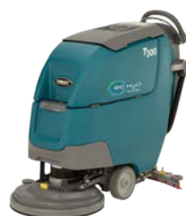
Single disk: 500 mm

The T300 scrubbers have multiple machine head types to fit your cleaning applications and optimise cleaning performance for specific areas.