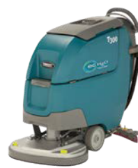
Dual disk: 600 mm