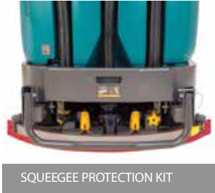
SQUEEGEE PROTECTION KIT

Simplify training and keep the operator's attention facing forward with the Touch-n-Go™ Control module. The large green 1-Step™ Start Button activates the scrubbing systems and engages the most recent operating setting.