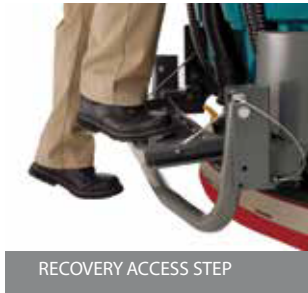
RECOVERY ACCESS STEP

Lower maintenance and repair costs with a heavy-duty front bumper and rear squeegee protection kit that prevents damage to the machine.